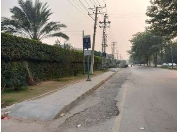
Bagh E Naran

(DR-06) Total Shelters = 12 / Total Pole Posts = 8