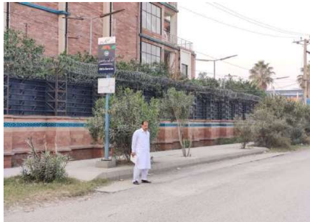
Phase 7 Terminal