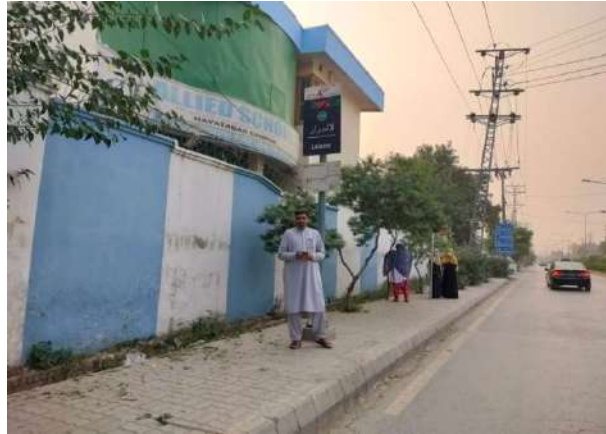
Malik Saad Market