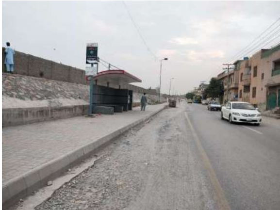
Bakht Khan Market

(DR-05) Total Shelters = 18 / Total Pole Posts = 6