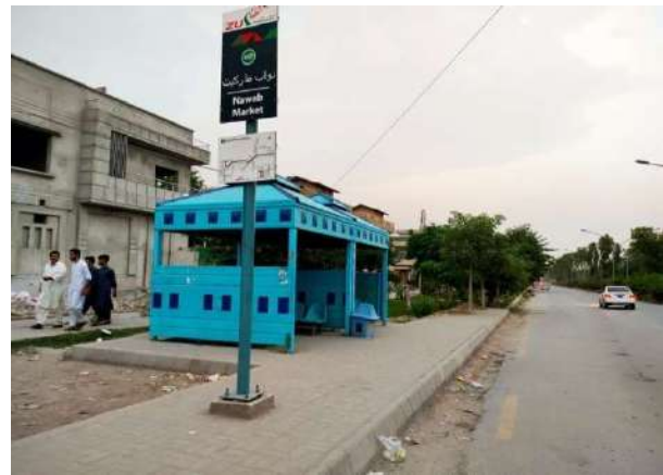
Phase 6 Terminal