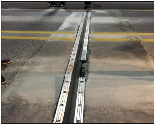
Grid Between Pole NOs.1479 to 1481