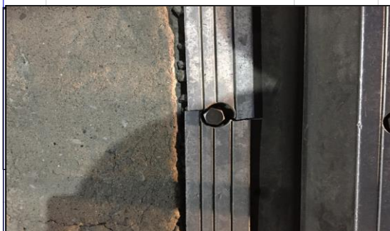
Grid Between Pole NOs.827 to 829