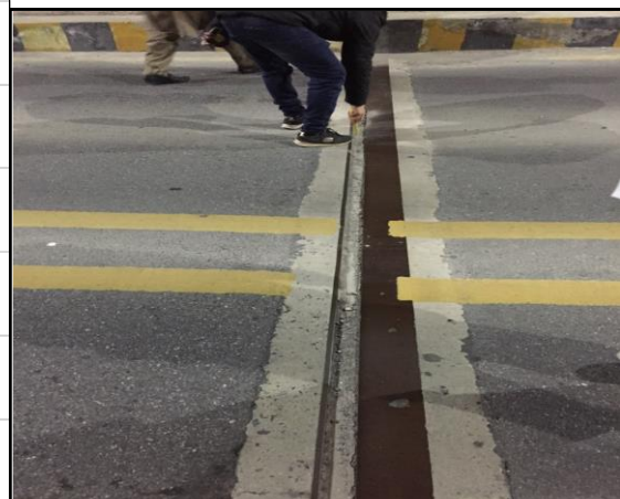
Grid Between Pole NOs.398 to 400