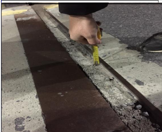
Grid Between Pole NOs.396 to 397