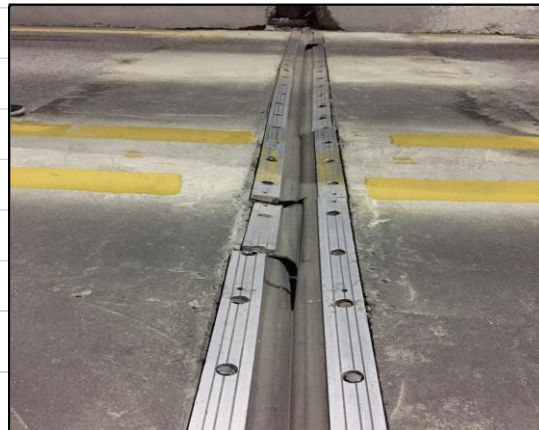
Grid Between Pole NOs.1491 to 1493